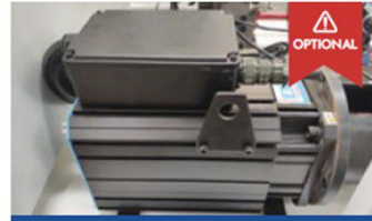
Servo Pump Unit